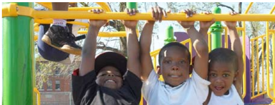
Giving youth serving organizations a firm grip on the future

The Right Intervention at the Right Time. Providing too much capacity building support too soon can have unstabling effects. For instance,